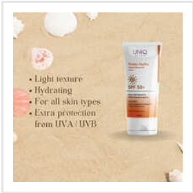
All Skin Sunscreen Lotion