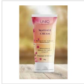
100gm Massage Cream