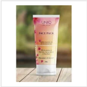
100gm Face Pack