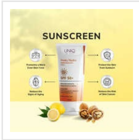
SPF50 Sunscreen Lotion