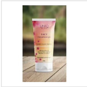
100gm Face Cleanser Gel