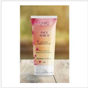
100gm Face Scrub