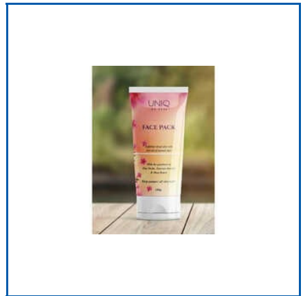
100GM FACE PACK